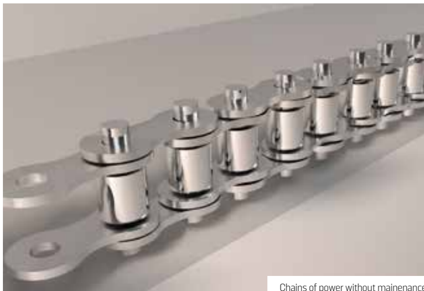
Chains of power without maintenance