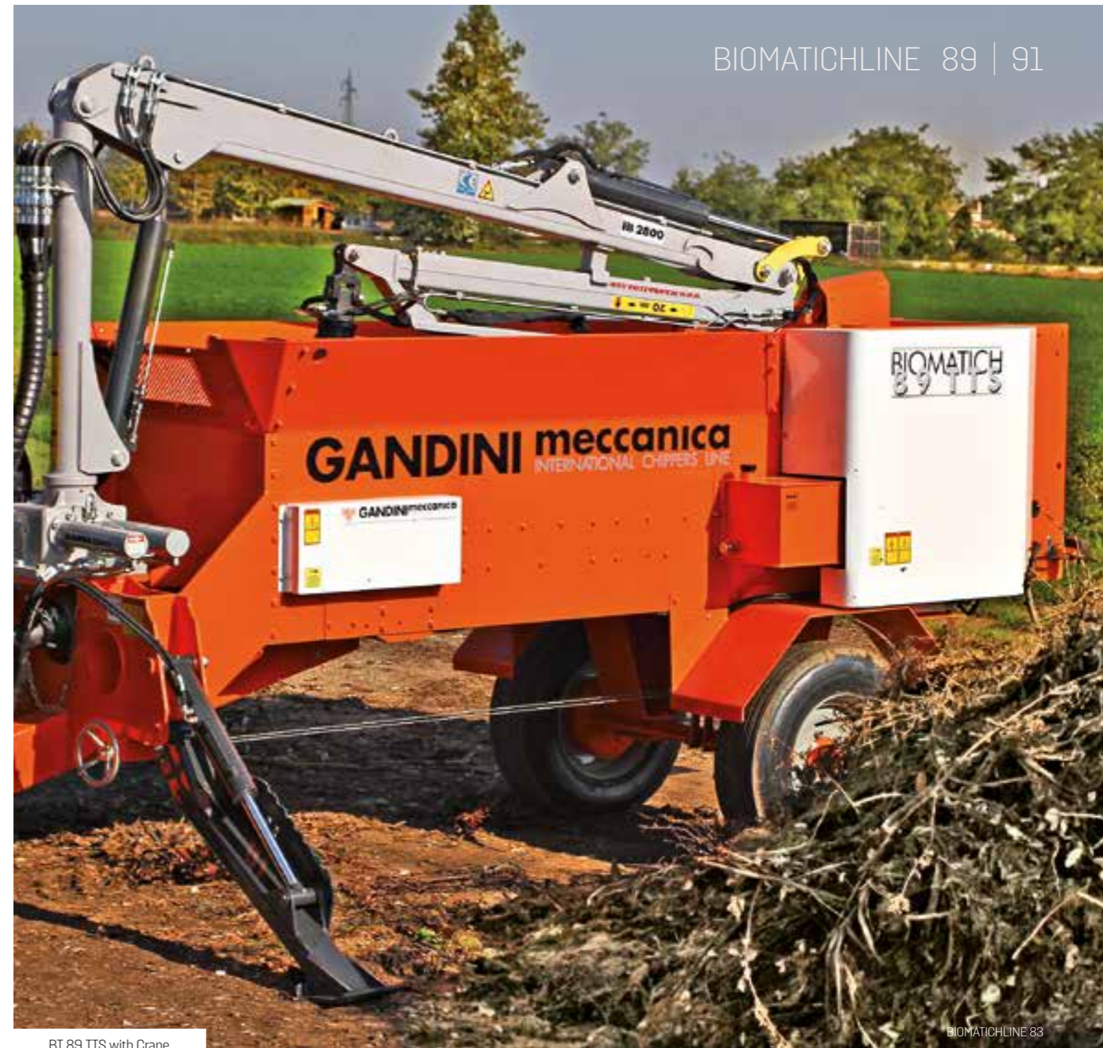
BT 89 TTS with Crane