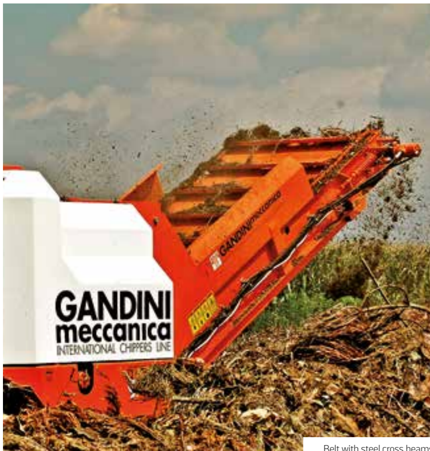
Belt with steel cross beams