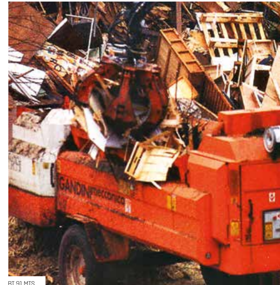
BT 91 MTS

Bt 89-91 tts: the tts version of this range of hammer shredders, with rigid axle and wheels, is ready to be driven and towed by any type of tractor with power at least 80 hp.