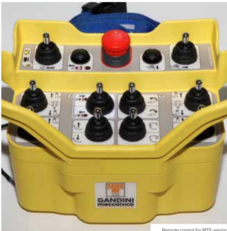
Remote control for MTS version