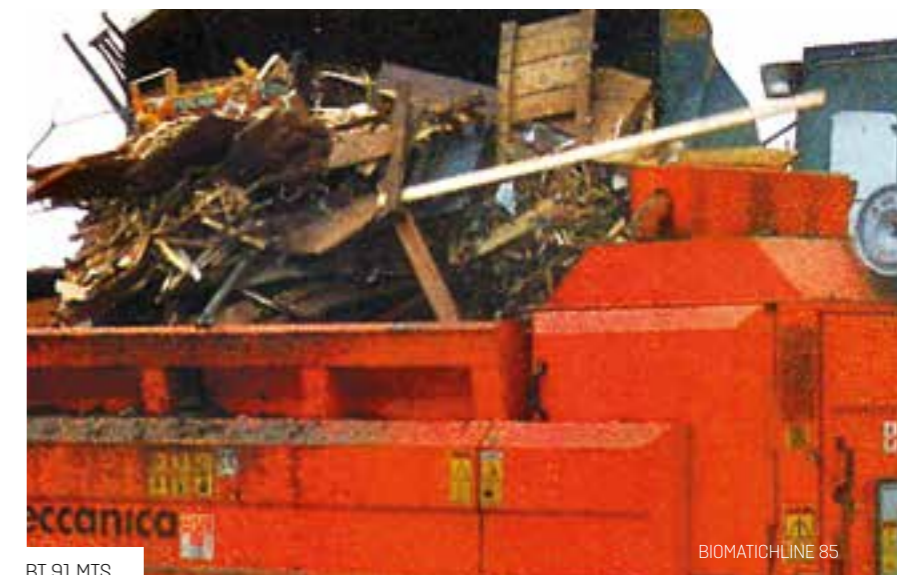
BT 91 MTS