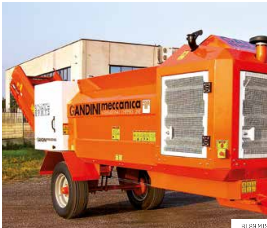
BT 89 MTS

Thanks to its very sturdy structure the BIOMATICH range is especially suited for heavy-duty and continuous work. Available in various outfittings, driven by the tractor's PTO, with independent engine, placed on self-propelled crawler, on roll-off truck, for stationary work station with electrical motor