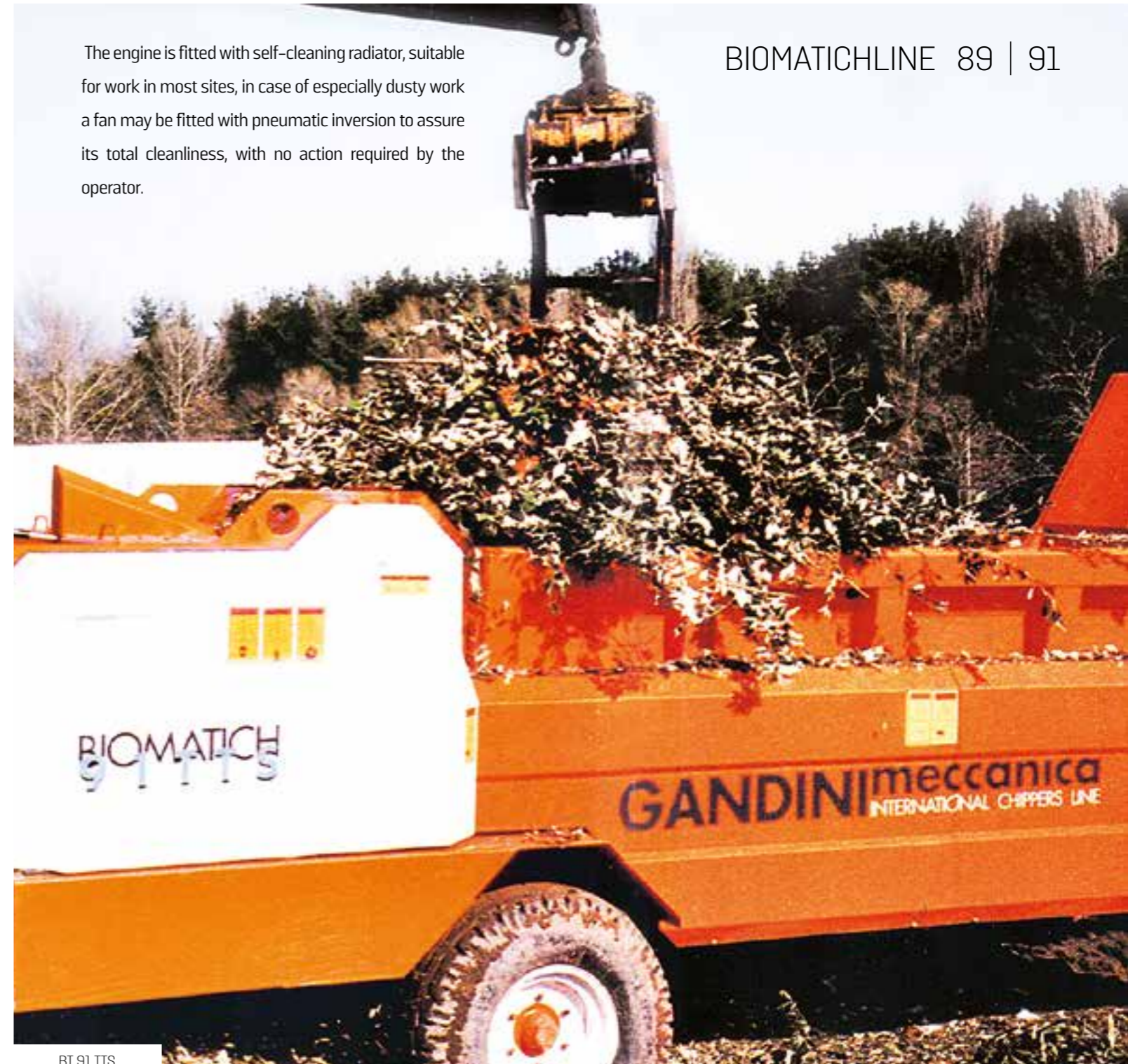
BT 91 TTS

The engine is fitted with self-cleaning radiator, suitable for work in most sites, in case of especially dusty work a fan may be fitted with pneumatic inversion to assure its total cleanliness, with no action required by the operator.