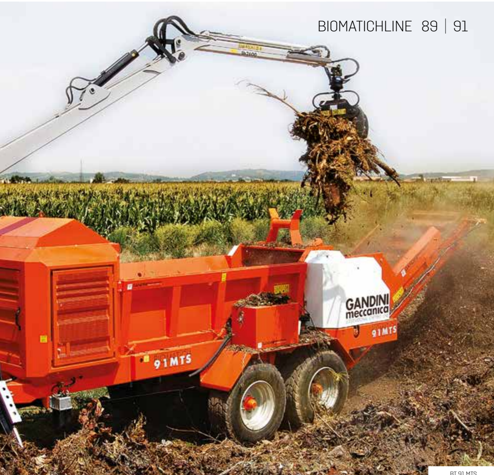
BT 91 MTS

The NOSTRESS device, which controls the grinding stage, interrupts feeding the material when the engine's speed is excessively low and resumes automatically as soon as the engine's power picks up again.