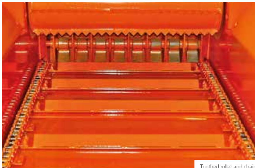
Toothed roller and chain

The large loading hopper makes it easy to feed the material to be shredded with any equipment, with wheel loader, log clamp, grapple, telescopic loader etc.