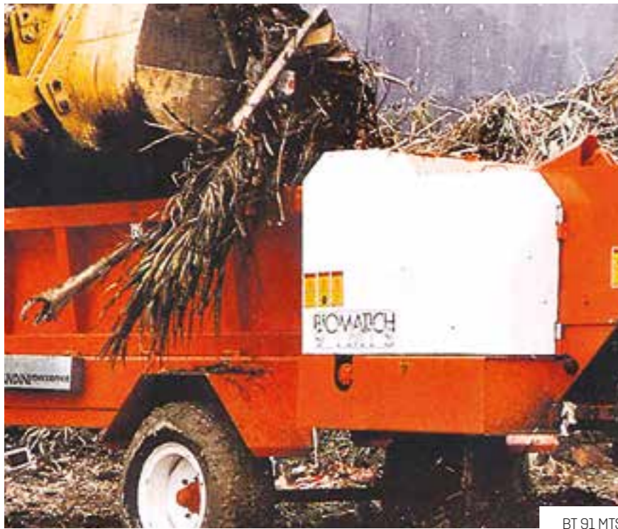
BT 91 MTS

The large loading hopper makes it easy to feed the material to be shredded with any equipment, with wheel loader, log clamp, grapple, telescopic loader etc.